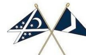
James Island Yacht Club